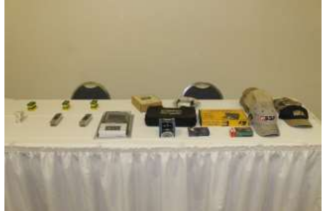
Door Prize Table

Each of the Officers and Directors were asked to bring items for the Door Prize Table. At the end of the meeting, tickets were drawn for the Door Prizes. Everyone in attendance was eligible to receive a door prize.