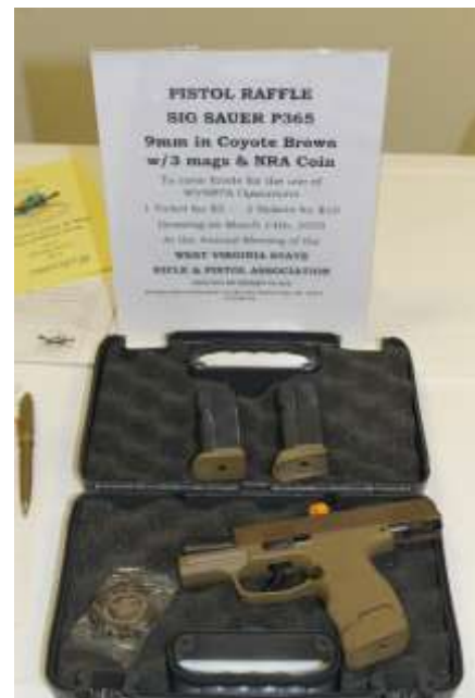
Sig Sauer P365

Putnam County Gun Club Junior Rifle Team (Small Bore Rifle Team) is holding their annual raffle / fundraiser. This year's raffle gun is a Citadel M1911 .45 ACP American Flag Pistol. The drawing will be held on September 20, 2020.