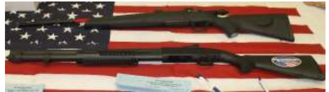
The WV Jr. Rifle Team is raffling off a T/C Compass Smith & Wesson .30-06 Rifle and a Mossberg 12 ga Model 590 TAC shotgun. Drawing is July 30, 2020

The WWSRPA was also held their annual fundraising raffles. To support the Junior Shooting Programs, a M1 Garand Rifle from the CMP was being raffled off. In addition, a Sig-Sauer P365 9mm pistol was raffled off for the WWSRPA General Fund.