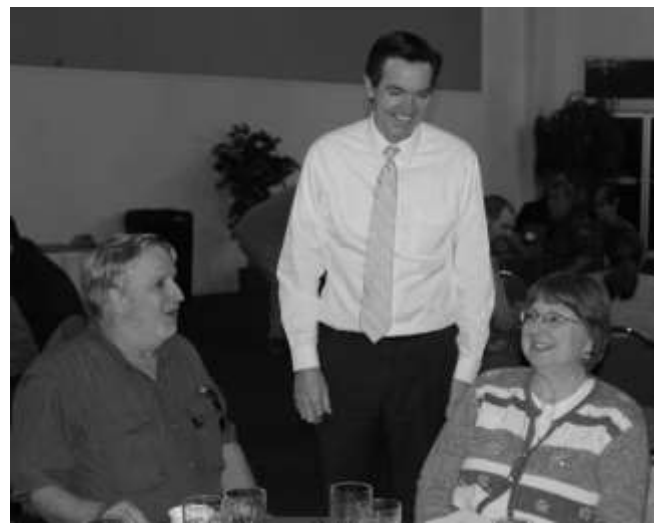
Congressman Evan Jenkins