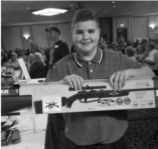
Winner of the Midland Trails FONRA Air Gun Donated by the WWSRPA

The Midland Trails Friends of NRA conducted their Banquet Feb 22 at Embassy Suite in Charleston. There were about 525 in attendance. The fund raising was successful, nearly $60,000 net, which portions go back to shooting programs. The Midland Trails Chairman sent WWSRPA a thank you letter for donation of Air Rifle to their dinner.