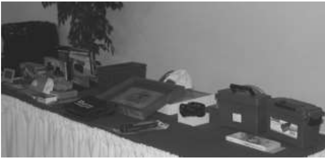
The Door Prize Table