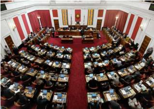
2017 House of Delegates Legislative Session

With the State of West Virginia facing a $500 million budget deficit, this year's session of the Legislature was billed as the year of the budget crisis. Although the focus was on numerous bills unrelated to the budget, among those were several bills introduced in the Senate and House relating to Second Amendment rights, firearms and hunting related issues.