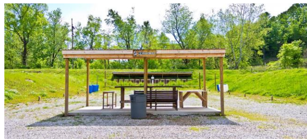
One of the Henderson Wilds Shooting Bays