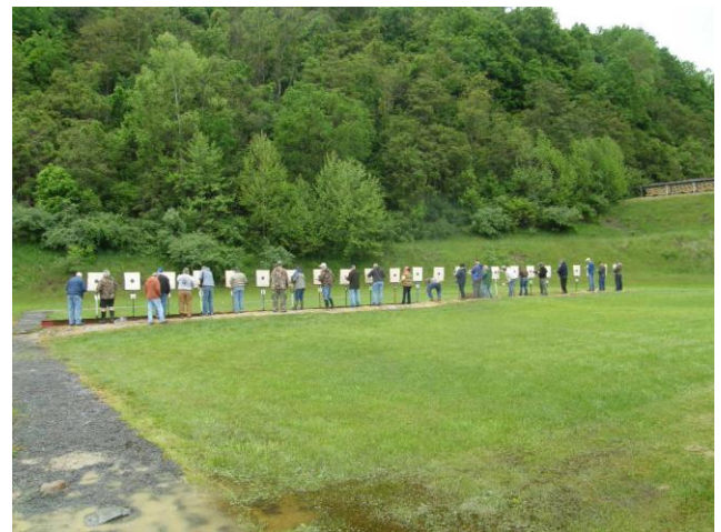
Competitors Scoring their Rapid Fire Targets