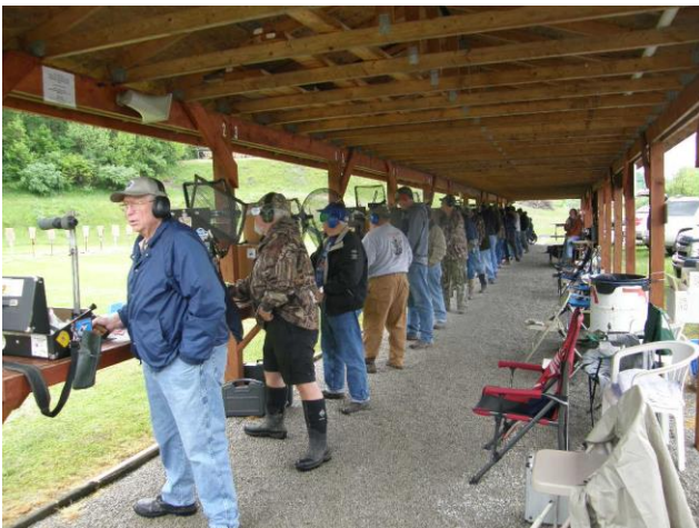
1 st Relay of Mountaineer Regional, note the competitors' rain gear and boots

30 Competitors participated in the Brassmasters sponsored Regional Precision Pistol Championships held May 21 st & 22 nd at the White Horse Center. The annual event drew competitors from Massachusetts, Michigan, New York, Ohio, Pennsylvania and throughout West Virginia. Severe thunderstorms and monsoon-type rain rumbled through the event on Saturday afternoon causing an extended delay in the competition. Heavy waves of rainfall resulted in swamp-like conditions on the range and a muddy and rutted parking area, but it did not dampen competitors' spirits or scores.