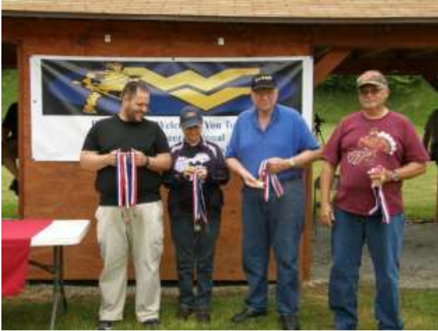
Wadcutter's winning team