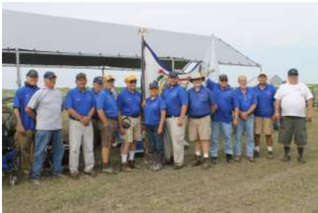
Members of the WV Pistol Teams

Our teams did well with the WV Blue team placing 9 th Expert, the WV Green team placing 19 th Expert and the WV Gold team placing 11 th Sharpshooter. Our Hardball team had to compete "Out-of-competition" as we did not have a "New Shooter". A "New Shooter" is defined as someone who has never before competed on a hard ball team. This was unfortunate as the sport needs new shooters and we need to find new competitors willing to come to Camp Perry.