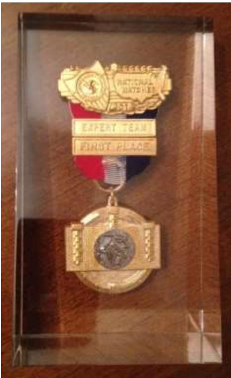
Expert Team Trophy