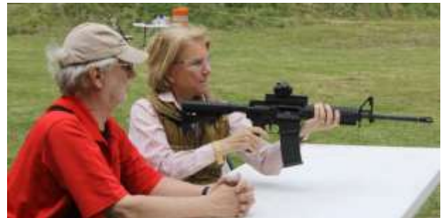
Rep. Shelley Moore Capito shooting a "Black Rifle"

To learn about future matches at the Beckley Gun Club, sign-up for one of the training sessions or just to find out about our club, you can like us on Facebook or visit us at www.beckleygunclub.com .